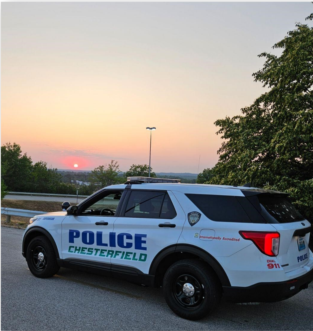
Sunset in Chesterfield